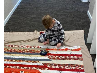
The ladies were joined by a little helper in January!